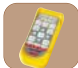
IR ClonePRO™ Programming